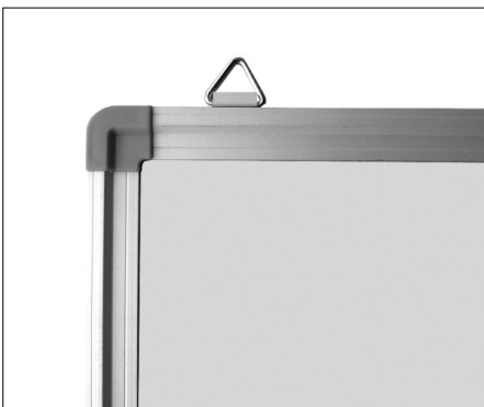
Detail of mounting point