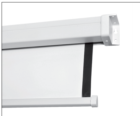
Black stripes on sides of the screen surface