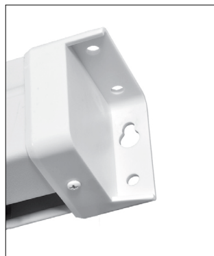
Integrated suspension points on the right and left side