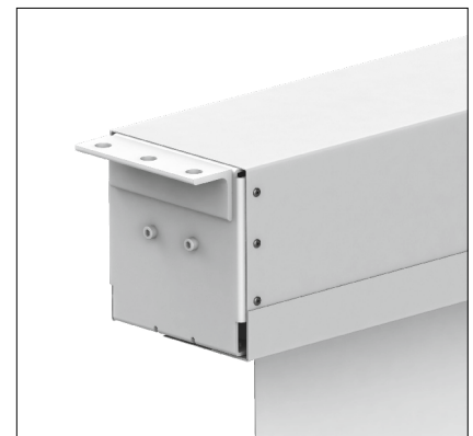
Mounting brackets for direct ceiling installation