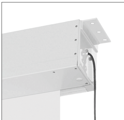
Metal construction of housing coated with colour RAL-9003